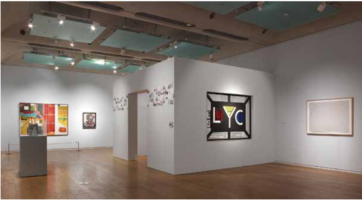
Left to right: Yinka Shonibare, Untitled (Dollhouse) , 2002, wood, fabric and mixed-media, 33 x 20.3 x 27.3 cm. Courtesy of Museums and Galleries, City of Bradford Metropolitan District Council, purchased, 2005. R. B. Kitaj, Trout for Factitious Bait , 1965, oil on canvas, 152 x 212 cm. Courtesy of The Whitworth, purchased with assistance from the Peter Stuyvesant Foundation, 1976. Frank Auerbach, Head of E.O.W III , 1963–64, oil on board, 68.6 x 57.8 x 4 cm. Collection of Manchester Art Gallery, accepted in lieu of inheritance tax by H M Government and allocated to Manchester Art Gallery, 2015. LYC window , Perspex and wood, inspired by the original window created for LYC Museum by artist David Nash. Do Ho Suh, Who Am We? (Brown) , 1999, iris print on somerset paper, 8.9 x 119.4 cm. Courtesy of Museums and Galleries, City of Bradford Metropolitan District Council, presented by the Contemporary Art Society, 2005.

by her tutor at the age of fifteen, and forced to prove the validity of her testimony in the courts. “Through this visual reference,” Stephanie Straine writes, “Biswas connects her image of female strength and empowerment (making dramatic use of the colour red) to a longer narrative of the suppression of women artists throughout art history.” 11 The gesture of placing works by Biswas and Himid on either side of Northcote’s painting is a subtle homage to the activism of both artists as feminists and participants in the Black Arts Movement of the 1980s. 12 Himid included Biswas in a trio of exhibitions she curated at the time, which “marked the arrival on the British art scene of a radical generation of young Black and Asian women artists”— Five Black Women at the Africa Centre (1983), Black Women Time Now at Battersea Arts Centre (1983–84), and The Thin Black Line at the Institute for Contemporary Arts (1985). 13 A re-staging of these exhibitions, Thin Black Line(s) took place at the Tate Britain between 2011 and 2012, in which Housewives with Steak Knives was shown. 14