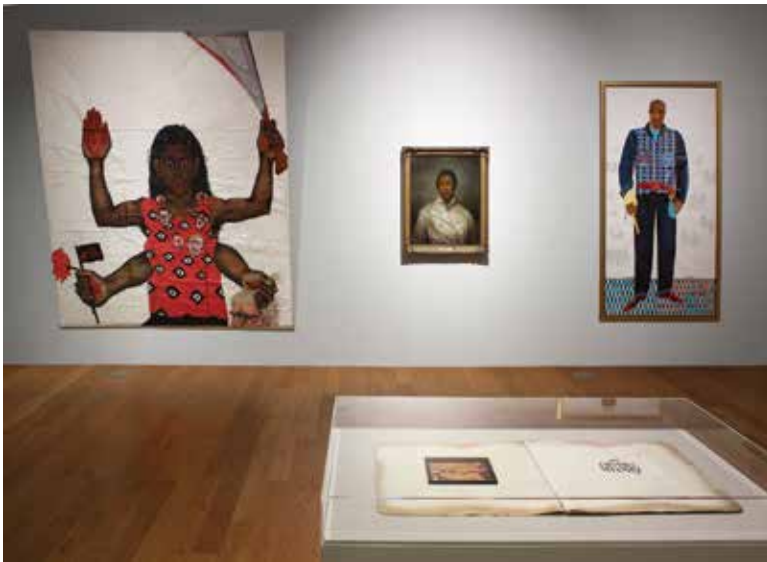
Left to right: Sutapa Biswas, Housewives with Steak Knives , 1985–86, acrylic, pastel and Xerox collage on paper mounted on canvas, 246 x 222 cm. Courtesy of Museums and Galleries, City of Bradford Metropolitan District Council, purchased with the assistance of the V&A/MGC Purchase Grant Fund, 1994. James Northcote, Othello, the Moor of Venice , 1826, oil on canvas, 76.2 x 63.5 cm. Collection of Manchester Art Gallery, purchased by the Royal Manchester Institution, 1827 and transferred to Manchester Art Gallery, 1882. Lubaina Himid, The Tailor , 2010, acrylic on paper, 183 x 102 cm. Collection of Manchester Art Gallery, purchased from the artist in 2010. Foreground: Keith Piper, An Artist’s Story , 1986, canvas, paper, and spray paint, 122 x 122 cm. Courtesy of Museums and Galleries, City of Bradford Metropolitan District Council, purchased with support from the V&A Purchase Grant Fund, 1988.

to de-imperialize institutions and amplify the overlooked work of black artists,” 6 Himid’s painting is positioned next to James Northcote’s 1826 portrait of African-American actor Ira Aldridge, the first black actor to play a Shakespearean role in Britain. This was the first work acquired by Manchester Art Gallery, and it depicts Aldridge as Othello, the Moor of Venice, dressed in a pristine white robe against a tempestuous, greyscale background, his eyes locked in a tense sideways glance. Aldridge first played Othello at the Royalty Theatre in London’s East End in May 1825, 7 and soon became known as the African “Roscius”—a name that refers to a celebrated actor from the Roman Empire who was born into slavery. 8 The Manchester Art Gallery acquired Northcote’s painting after the first art exhibition at the Royal Manchester Institution in 1827, some six months after Aldridge performed Othello at Manchester’s Theatre Royal. (Apparently Northcote’s “was judged the ‘best executed’ work” on show.) 9 As Laura Cumming writes, the painting’s acquisition “was undoubtedly a radical choice for 1827,” perhaps even reflecting “Manchester’s early support for the anti-slavery movement,” given it was here that the abolition movement started. 10